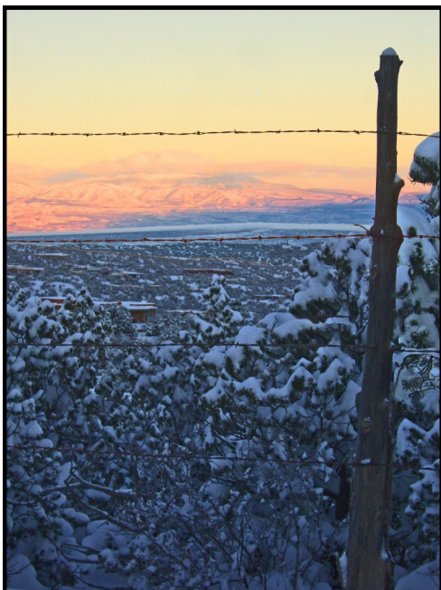
Fence in Snow

Submit electronically to admin@latoth.org