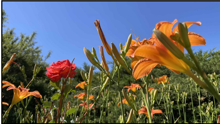
These beautiful flowers were photographed by Father Raymond in the TOTH upper parking lot and the courtyard on June 8, 2022.