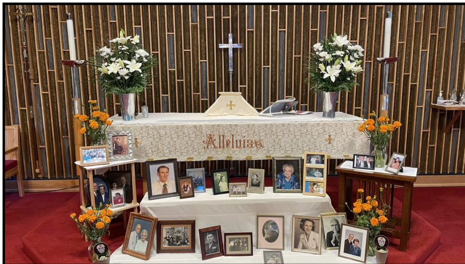
The Ofrenda at the TOTH altar, November 2021

Trinity on the Hill is a home for many families and those who have passed on will be honored and remembered during our Eucharist, and their spirits welcomed to the altar to share in our thanksgiving.