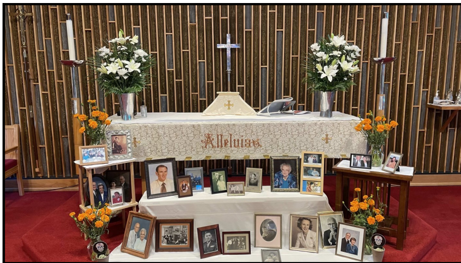
The Ofrenda at the TOTH altar, November 2021

Trinity on the Hill is a home for many families and those who have passed on will be honored and remembered during our Eucharist, and their spirits welcomed to the altar to share in our thanksgiving.