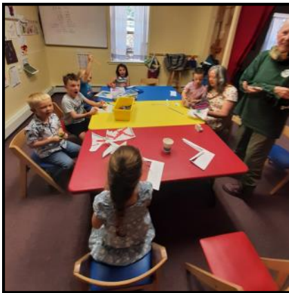
The class learned about Elijah being taken up by a whirlwind. They made a pinwheel craft.

The younger Sunday School class is continuing to learn about major characters in the Old Testament. The kids used Play-Doh to sculpt their favorite stories, so far. Here is Goliath being dressed in armor for his battle with David.