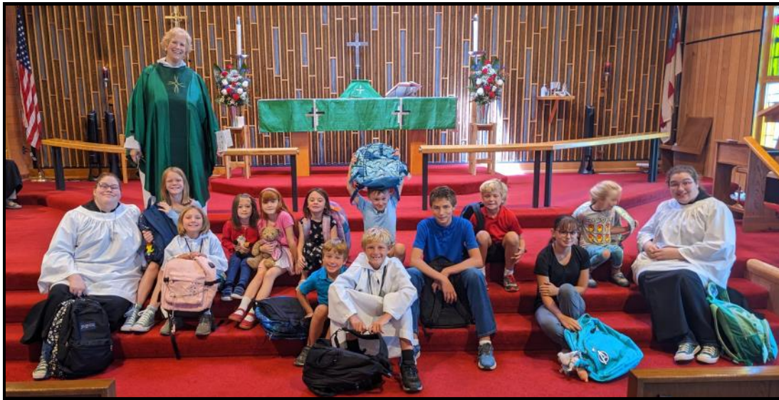
The annual Blessing of the Backpacks on August 11.